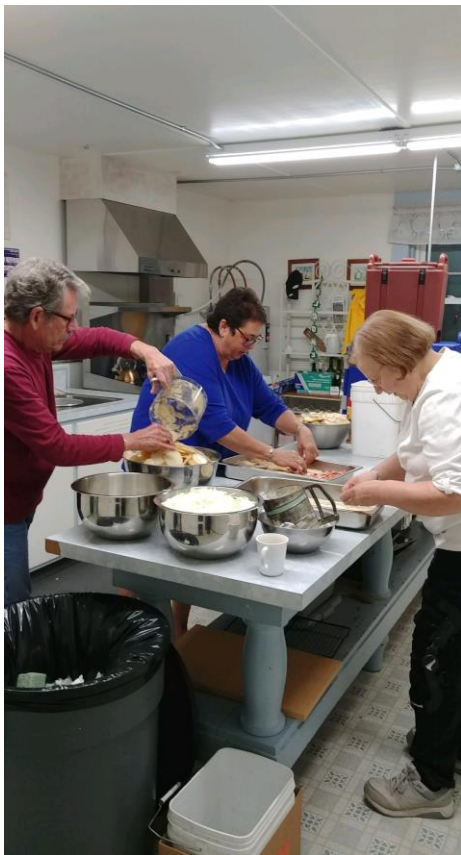
Some Pictures from Laksloda